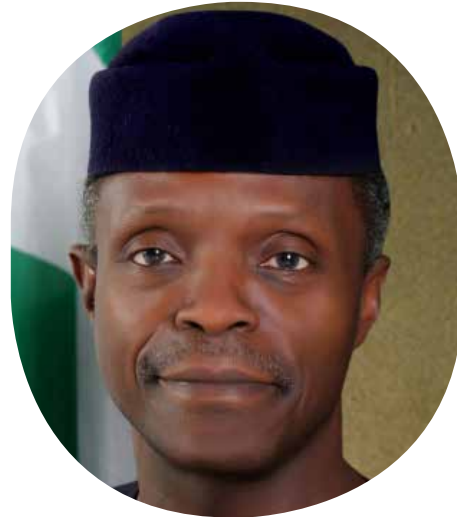
HIS EXCELLENCY YEMI OSINBAJO CON VICE PRESIDENT, FEDERAL REPUBLIC OF NIGERIA