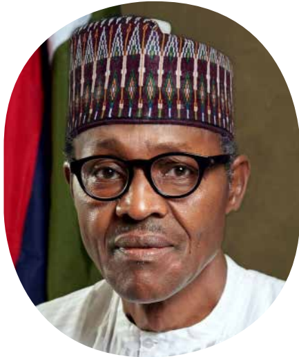
HIS EXCELLENCY MUHAMMADU BUHARI GCFR PRESIDENT, FEDERAL REPUBLIC OF NIGERIA